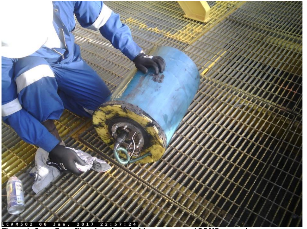
Figure 1: SmartFoam<sup>™</sup> tool equipped with rear mounted DDMD at receive

Not only did the SmartFoam<sup>™</sup> tool successfully inspect the pipeline through the existing wax deposits, the addition of the DDMD enabled the wax deposits to be mapped and quantified through the pipeline and a total volume of wax calculated. As a consequence, the operator would be able to formulate an appropriate strategy for both cleaning and wax-mitigation going forward.