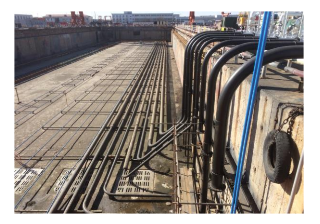
Figure 3: Operator's test loop located in a dry-dock.

Following initial contact with i2i pipelines, the client asked for a review of the design of their operational foam pigs and to comment accordingly whilst at the same time producing a proposal to inspect the pipelines. The inspection work would be contingent on successful testing of the SmartFoam<sup>™</sup> technology at their extensive test facility in China.