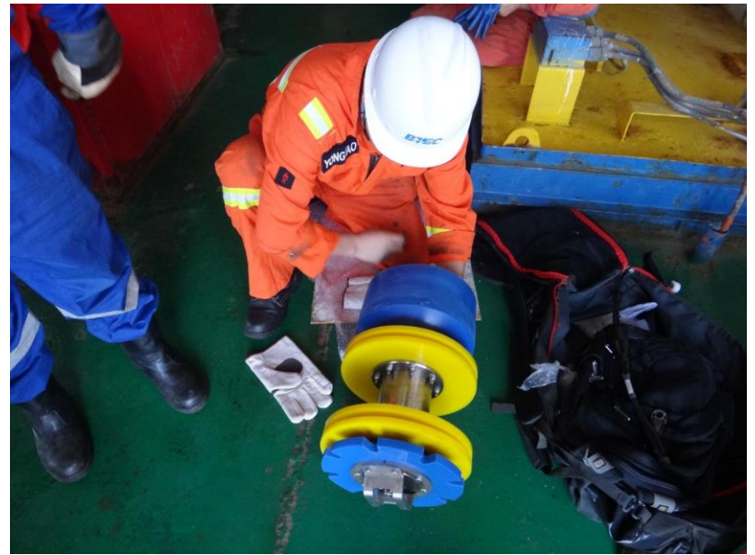
Figure 2: Pioneer™ tool offshore prior to launch

After evaluation of pipeline operating conditions and the size of the reported dents from the calliper tool, i2i deployed the 12" Pioneer™ pig to inspect the pipeline.