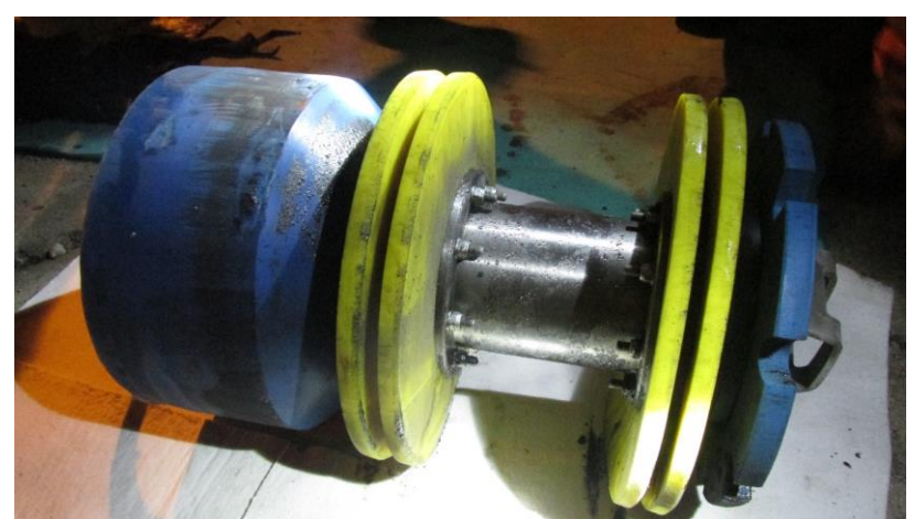
Figure 3: Pioneer™ tool at receive onshore in good condition

Due to having to use an undersized body and battery pack for the Pioneer<sup>™</sup> tool because of the constraints around the dents in the line, the tool gathered data for approximately 31km out of the 50km before the batteries ran out. However, after a quick overnight re-charge and a quick return offshore the tool was re-run at an increased flow rate and gathered data for the complete pipeline. The tool also had the IMU dis-abled to help mitigate power consumption.