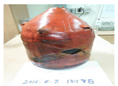
Figure 2: Operator's pig at receive