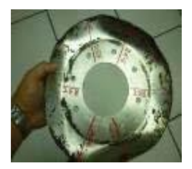
Figure 1: Examples of damaged gauge plates

Following multiple runs with gauge tools, the operator decided to contract one of the major ILI vendors to inspect the pipeline with an MFL tool and, ahead of the inspection run, provide a calliper tool to measure and quantify the dents in the line to ensure subsequent safe passage of the ILI tool without getting stuck.