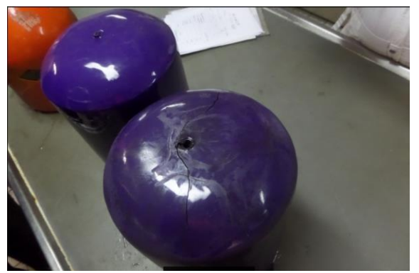
Figure 4: Dummy pigs before/ after trial run.

The final stage before a fully operational run was to test the design under conditions including being received in a pig valve. For this stage of the operation the dummy pig was run in the offshore pipeline and successfully received in the pig valve. There was no evidence of tumbling in the pipeline and the pig was received as expected and in the correct orientation. The internal basket mark called "the spider" on the pig was a clear confirmation that the pig had not tumbled during operation and had been received correctly.