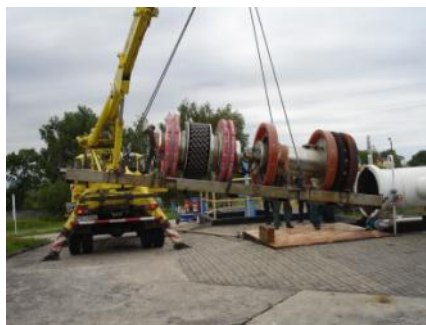
The KORSONIC Pig

The KORSONIC pig is an ultrasonic inspection tool dedicated to comprehensive survey of crude oil and product pipeline walls. The tool travels through a pipeline propelled by an oil flow measuring and recording local pipeline wall thickness and distance to inner wall surface as it moves through the line. The purpose of this measurement is to provide the operator with a survey report, which precisely documents all defects and anomalies of the pipeline (especially metal losses due to erosion or corrosion) as well as some geometry deformations. The report also includes suggestions as to rehabilitation of the pipeline based on strength calculations.