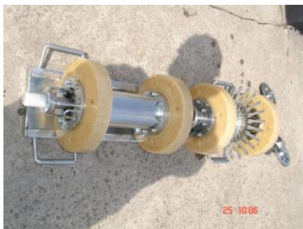
The KALIBRAK tool

The KALIBRAK tool is designed to record and locate changes in the internal geometry of the pipeline. The purpose of internal geometry measurements of a pipeline is to provide the operator with an inventory report, which includes the location and parameters of out-of-roundness anomalies and fittings.