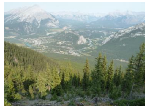
Sightseeing at neighbouring Banff, before the IPCE event in Calgary, Canada