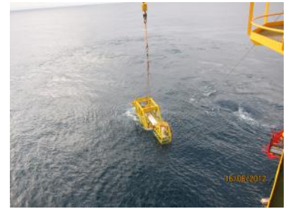
Figure 2: Subsea launcher Snøhvit

provided brush-magnet cleaning pigs equipped with a gauge plate and pipeline data logger.