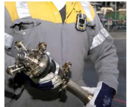
A.Hak's 4" Push-Pull inspection tool

This concrete covered pipeline had a length of about 130 meters and could be entered from both ends. The pipeline was filled with water to act as a coupling liquid in order to make UT measurements possible. The tool was launched through a 4" launcher installed by A.Hak inspection engineers.