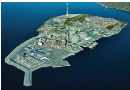
Figure 1: Melkøya

Snøhvit is the first major development on the Norwegian Continental Shelf without a surface installation.