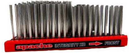
New Apache Pipeline Products' Integrity XB Cleaning Brush ●