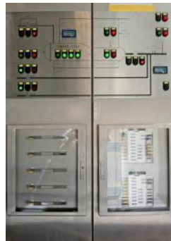
Custom made control cabinet

Following the Netherlocks philosophy, this project demonstrates that the intelligent use of electro-mechanical safety systems and key interlocking processes allows the potential risk of human error to be eliminated.