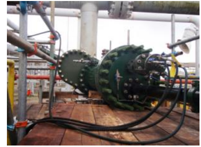
STATS Group's BISEP™ deployed

ated tethered Tecno Plug™ technology has been used in Malaysia."