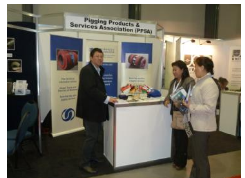
PPSA exhibiting at IPCE, Calgary, Canada

As you can see, it is a very busy time for our association. We hope to see you in either Berlin, Aberdeen or Houston – or maybe all three! Failing that just drop us an email as we always welcome your feedback and ideas. We hope you enjoy this edition of the newsletter.